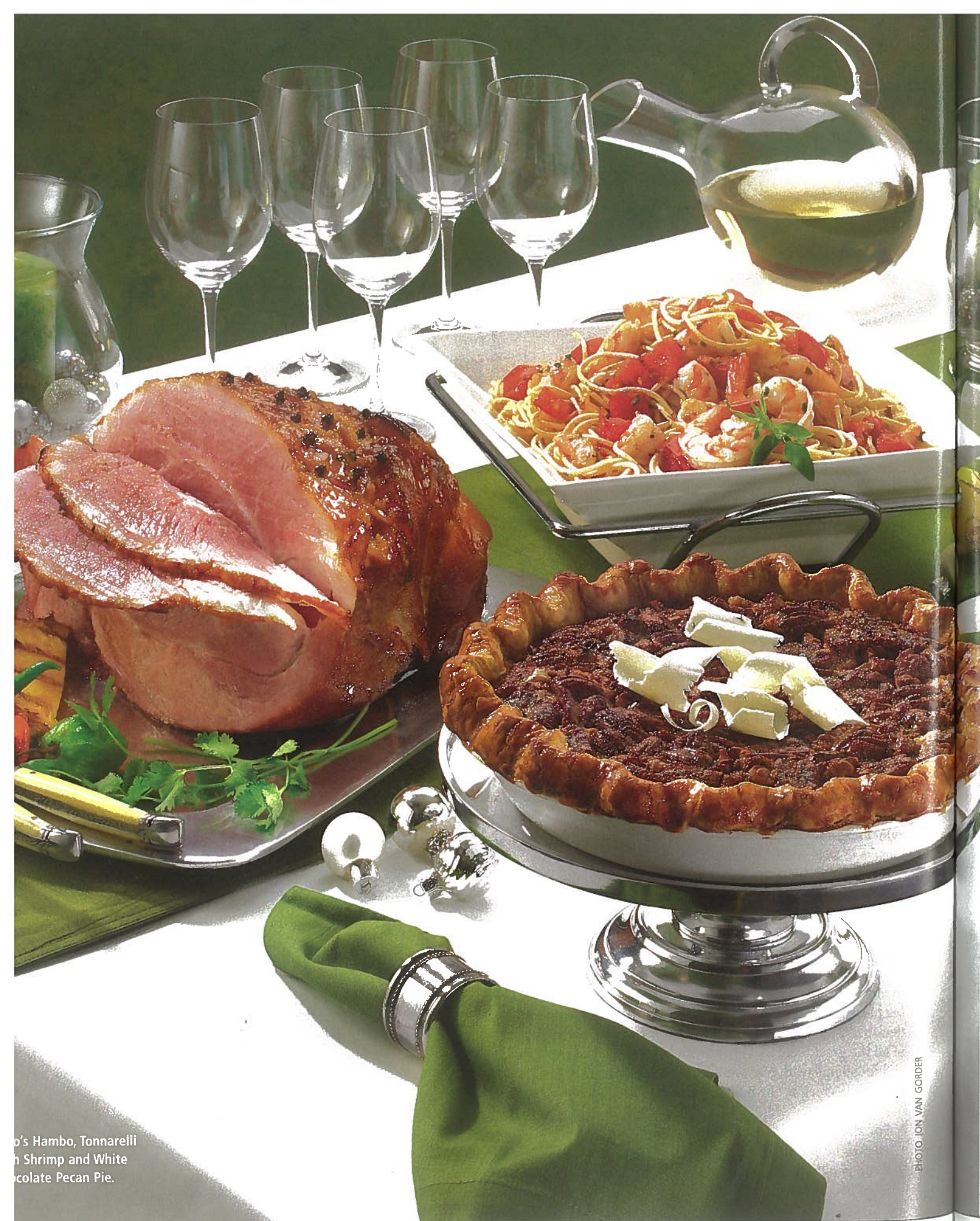
o's Hambo, Tonnarelli n Shrimp and White colate Pecan Pie.